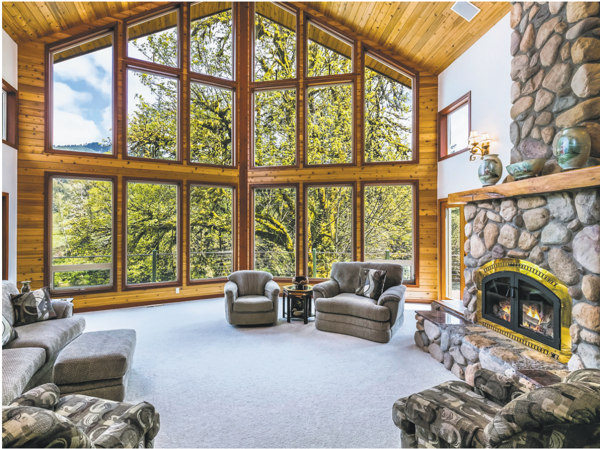
Cascade Sotheby's International Realty

The living room at this Tidewater, Ore., home features floor-to-ceiling windows within a wood-paneled wall and a stone fireplace.