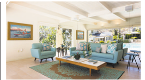
Liz Rusby / Grubb Co.

The living room at this Tidewater, Ore., home features floor-to-ceiling windows within a wood-paneled wall and a stone fireplace.