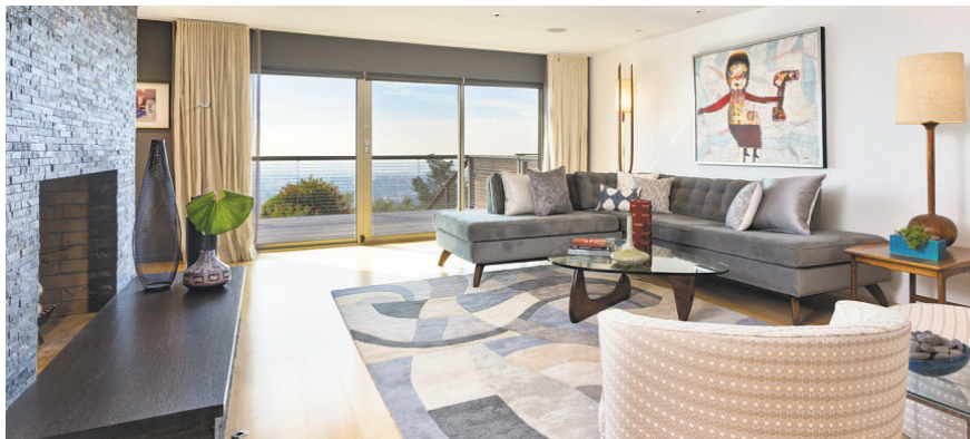
Liz Rusby / Grubb Co.

"Staging a home for market is different than designing for living," Cronin said. "For example, you might place a bed differently because it will show better in photos. There's definitely a distinction between designing for living and designing for staging."